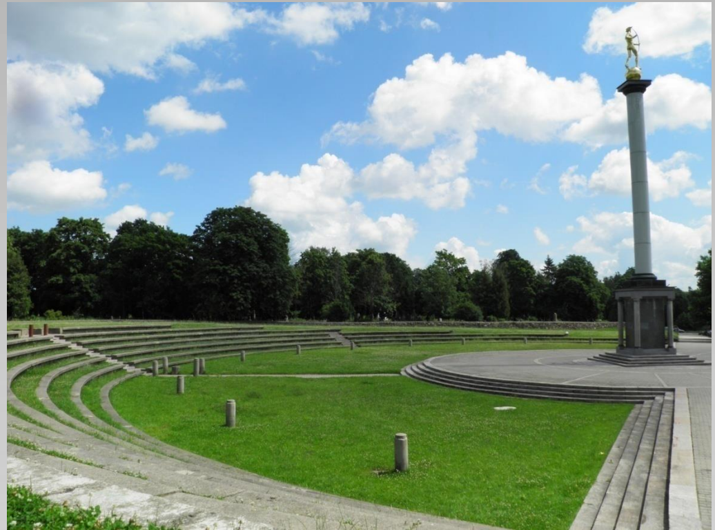
5. Sundial Square