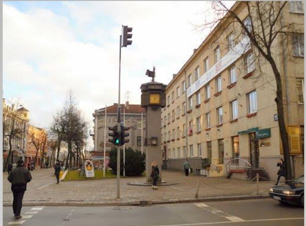
2. "Cockerel" Clock Square