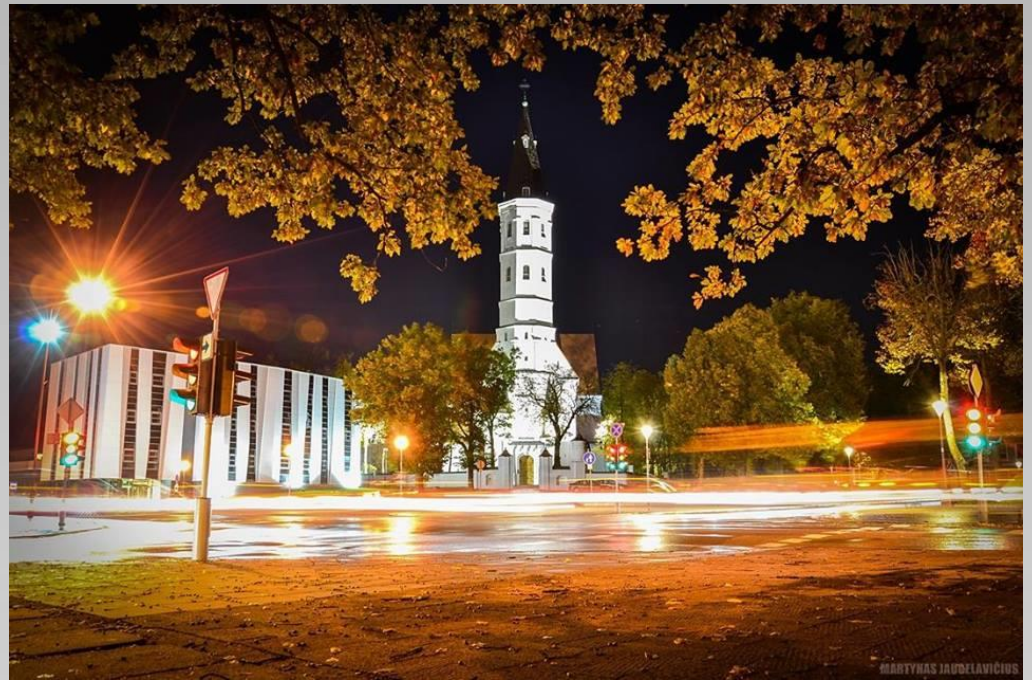
7. Šiauliai Cathedral of the Apostles St. Peter and St. Paul