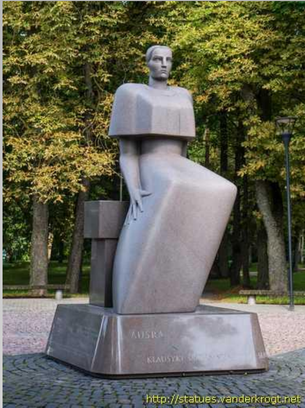
1. Sculpture "Dawn"