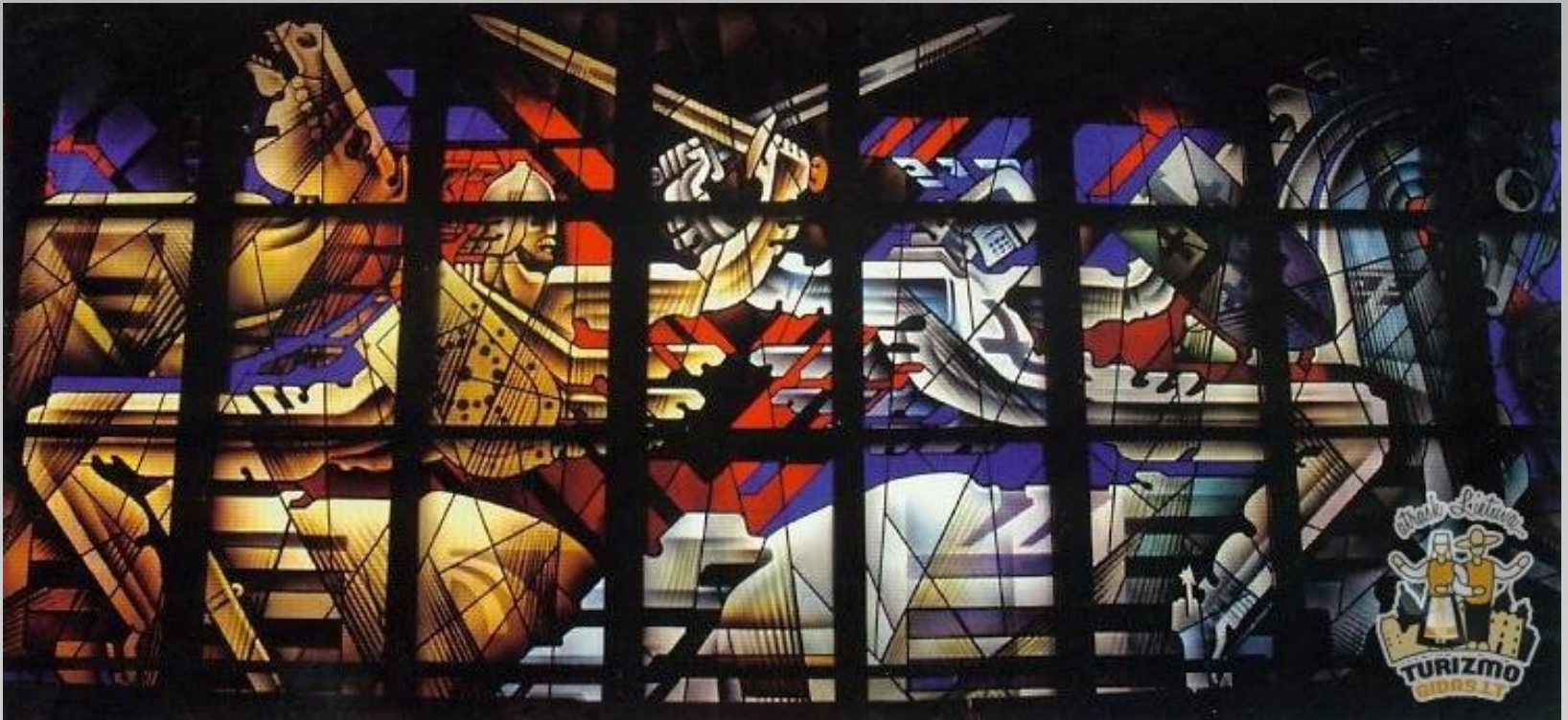
3. Stained Glass Window, "The Battle of the Sun"