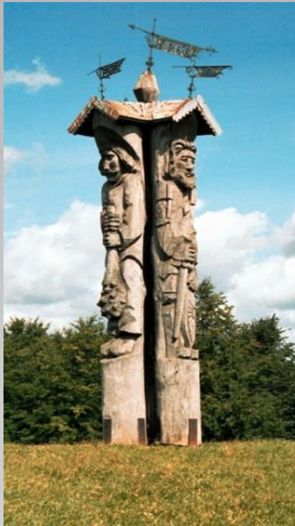
6. Monument in Sladuve Park for Sun Battle